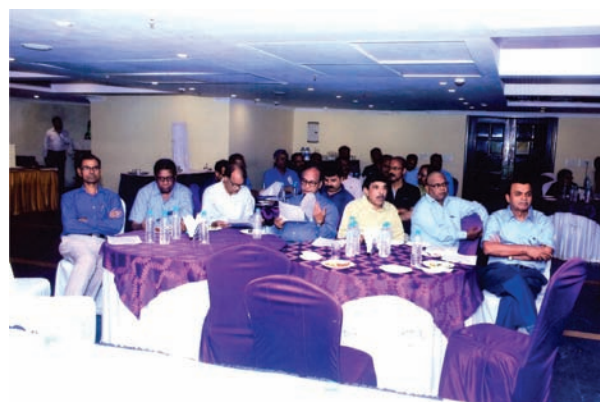
Members participating in AGM Meeting.