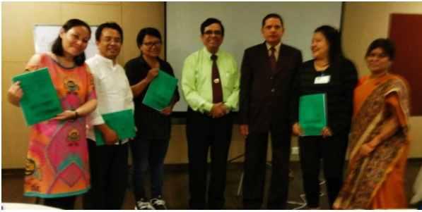
Participants holding above Booklet

administration for timely construction of Hydro Power plants without disputes)