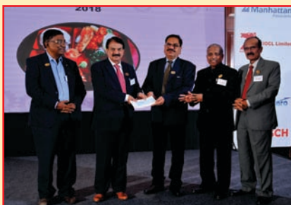
SCALE 2018 team handing over a Cheque Pro-rata of SCALE 2018 to NHQ