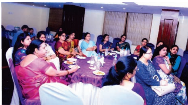
Family Members present on the day of AGM.