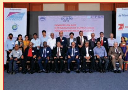
SCALE 2018 - Committee and Volunteers - A Group Photo graph