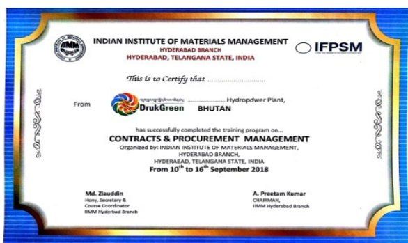
Certificate Format issue to Bhutan Team