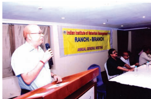
Chairman Ranchi Branch Addressing / Welcoming the Member on AGM on 31/8/2018