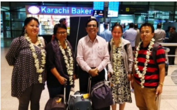
Arrival of Bhutan Team on 09-09-18 at RGI AirPort