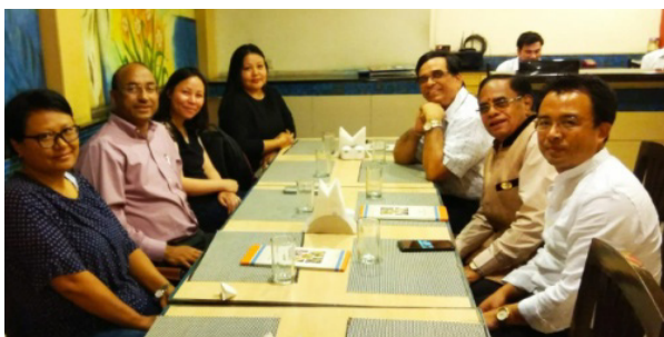
Departure of Bhutan Team on 16-09-18