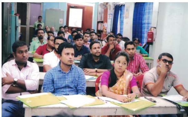
Inauguration of 60th batch of GDMM (Regular) July 2018 Session - View of students in inaugural Session.