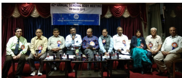
EC committee group photo