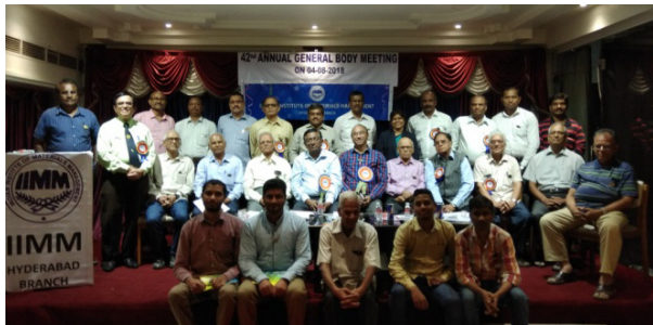
EC committee and few members and office staff – group photo