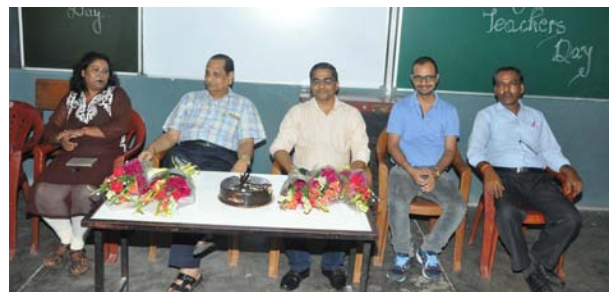
Faculties at the Teachers Day on 01.09.2018