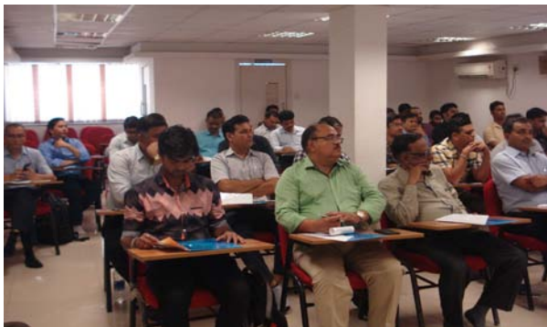
The Participants attending Workshop on the first day.